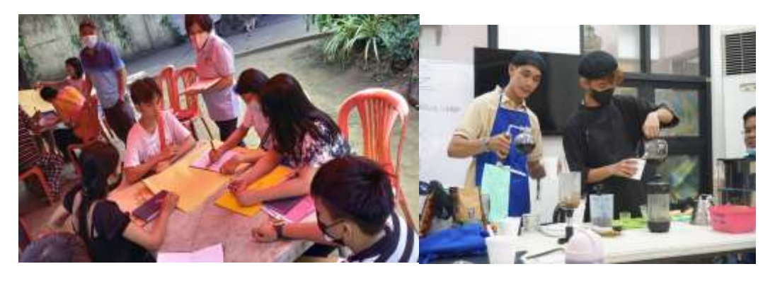
The photo on the left shows youth acquiring life skills. The photo on the right shows vocational technical training (barista).

In addition to the above six education/trainings, Project Bamboo provides microcredits for capital assistance among youth who have good business ideas but do not have the money for start-up. The loans are repaid on a regular basis with very minimal interest to familiarize them also with how loans and credits work.