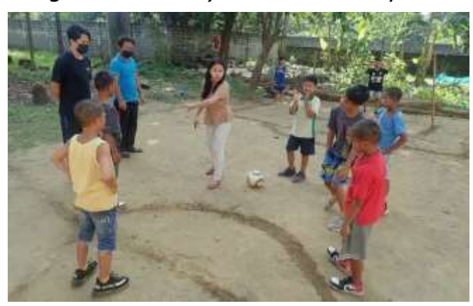
Children at sport-based life skills training

Donations will be used for court maintenance, training venue costs, transportation expenses for participants (vehicle rental fees, gasoline costs) and staff salary.